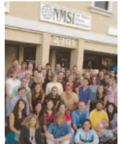
CGO staff outside of our office building