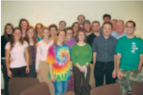
Participants, including all members of the COAT program, of a book discussion I helped facilitate

“Give thanks to the Lord, call upon His name; make known among the nations what He has done.” – Psalm 105:1